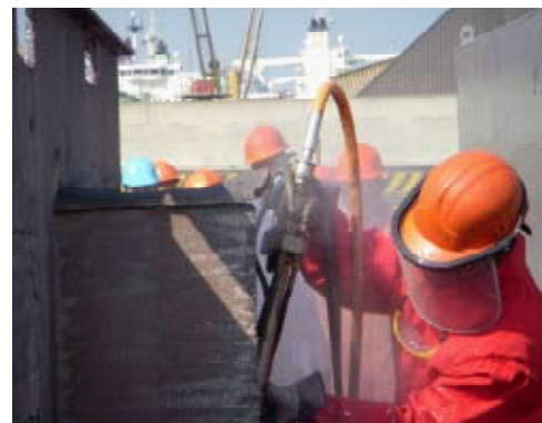
Hull & Tank cleaning in Dubai docks in a high time utilisation environment. No problems after 7 months of use.

It's unique benefit is that the system will not operate without providing protection for the user.