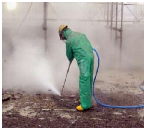
Stringent testing on-going in a Hydro demolition environment. No problems after 7 months of use